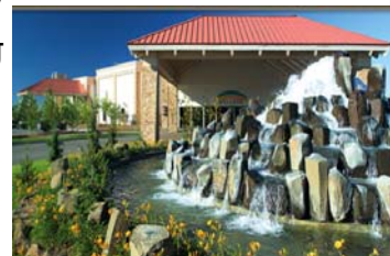
Rolling Hills Resort