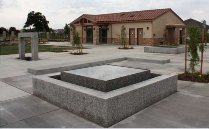
The new Santa Clara Memorial Park office with water features in the foreground.

Placer County Cemetery District #1 has been a member since 2005. The district serves the City of Lincoln and surrounding areas of Placer County.